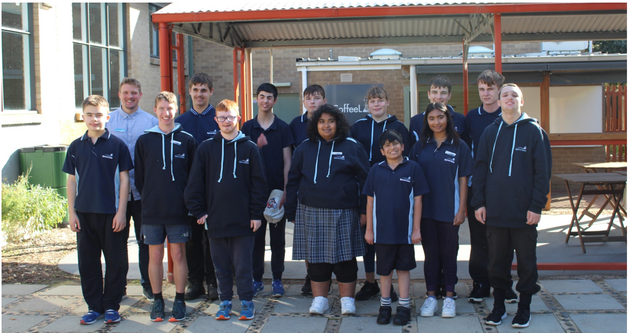
Meet the 2021 Student Representative Council.