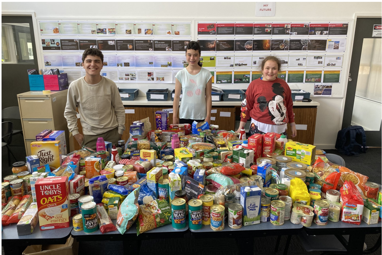
Year 11 students collected items for their food drive. Thank you for the donations.